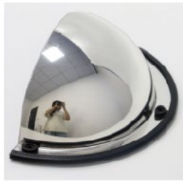
PMMA Mirror Lens