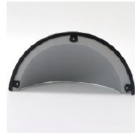
U Type Rubber Edge